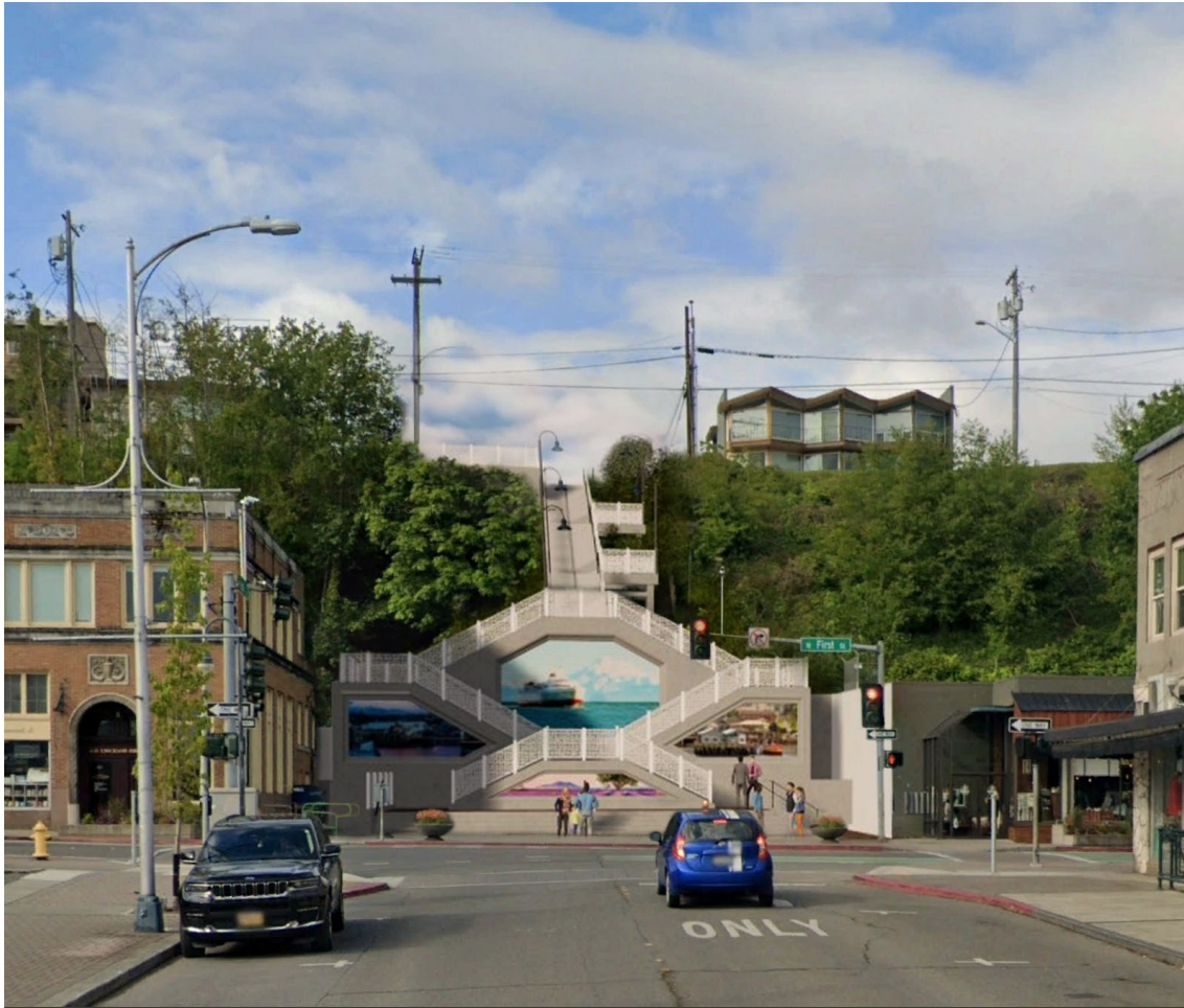
Option #1: Monumental Stairs