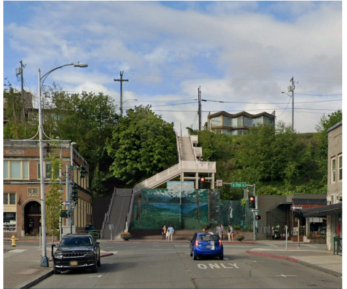
Option #2: Community Plaza